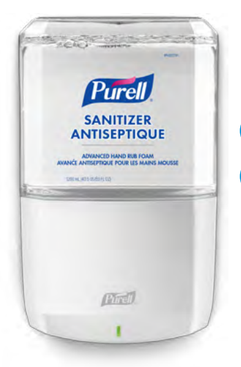
PURELL ES8 Energy-On-The-Refill and SMARTLINK™ Capability