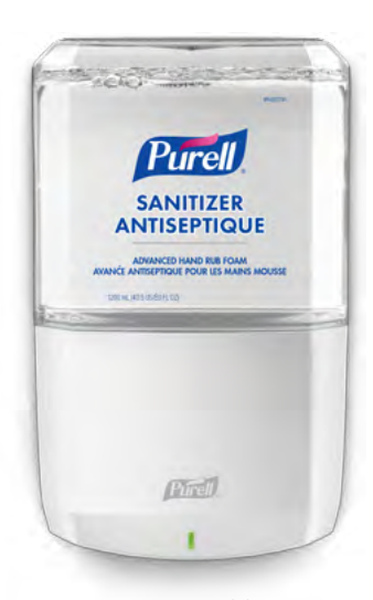
PURELL ES6 Touch-Free