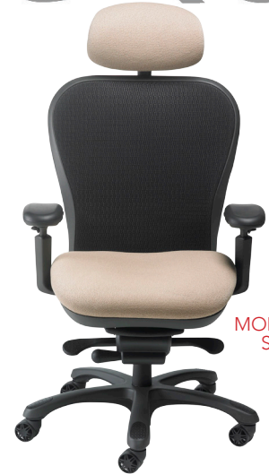
MODEL 6200D SHOWN