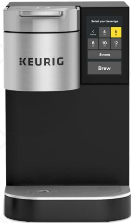
Keurig® K-2500™ Coffee Maker