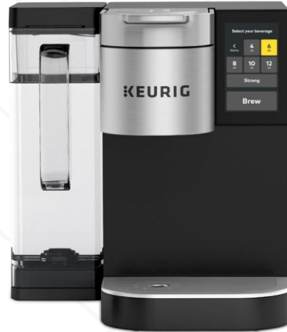
Keurig® K-2500™ Coffee Maker Water Reservoir Kit Bundle

Both versions can be connected to a water line; if the reservoir is in-use, simply disconnect and plumb the brewer to a water line.