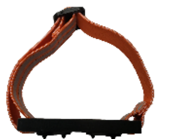
NON DEFINED HEEL