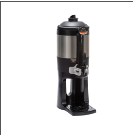
TF SERVER, 1G MECH GEN3 W TIMER