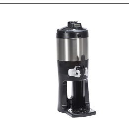
TF SERVER, 1G DSG GEN3