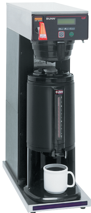
Model AXIOM-TS with Thermal Server (Thermal Server sold separately) Dimensions: 27.6" H x 9" W x 18.5" D (70.1 cm H x 22.9 cm W x 47 cm D)