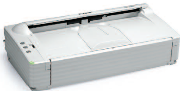
DR-2580C with Optional Flatbed Unit