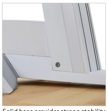
Solid base provides strong stability