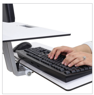
Large back-tilt keyboard tray