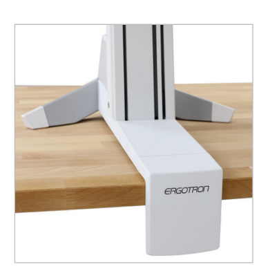
Clamps to the front of surface