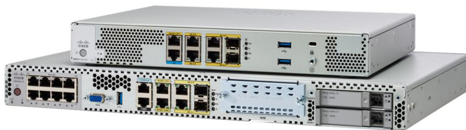
Figure 1. Cisco 5000 Enterprise Network Compute System Family

Figure 1 shows the Cisco 5000 Enterprise Network Compute System family. The Cisco 5400 ENCS (bottom) consists of three models: the 5412, 5408, and 5406. The Cisco 5100 ENCS (top) consists of one model: the 5104. It is available in three storage-capacity variants (64G, 200G, and 400G).