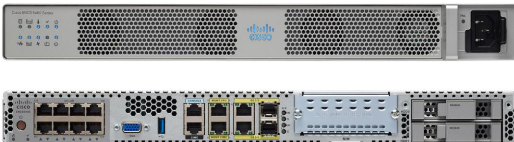
Figure 3. Cisco 5400 Enterprise Network Compute System – Front And Back

Figure 3 shows the front and back of the Cisco 5400 Enterprise Network Compute System platform.