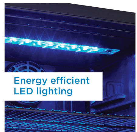
Energy efficient LED lighting