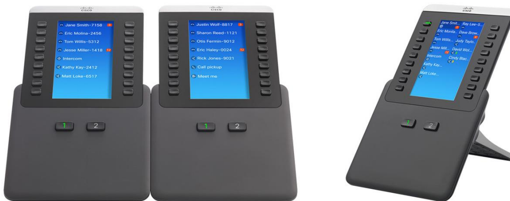
Figure 1. Cisco IP Phone 8800 Key Expansion Module

Quickly adapt to market changes. Increase productivity. Improve competitive advantage through speed and innovation. And deliver a rich-media experience across any workspace securely and with the best possible quality. Cisco® Unified Communications Solutions enable the collaboration that makes this possible (Figure 1).