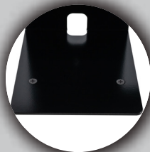
Heavy-Duty Steel Stand w/ Anchor Option