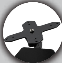
Flexible Universal VESA bracket