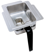
FUNNEL ASSY, SST-PP BLK HDL