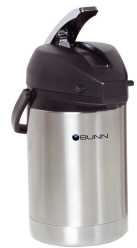
AIRPOT, 2.5L SST LA 6/ CASE