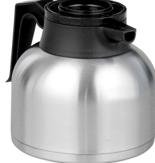
CARAFE,SST 1.9L SHRT BLK 1