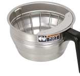
FUNNEL ASSY, SST-BLK HDL(7.12)