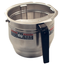
FUNNEL AY,W/DECAL GRT "C"7.12