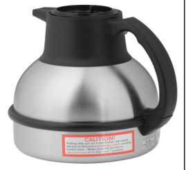
ACC,1.9L THERMAL CARAFE SST