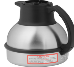
THERMAL CARAFE,ORN 1.9L 12PK