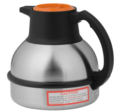
THERMAL CARAFE,ORN 1.9L 1PK