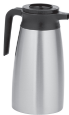
PITCHER,SST 1.9L TALL-6/CASE