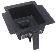
FUNNEL W/DECAL,PPK NAR BLK(SM)