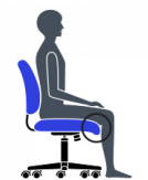
Waterfall Seat Edge