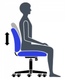
Back/Lumbar Height Adjustment