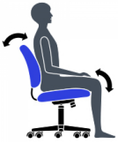
Chair Tilt Lock